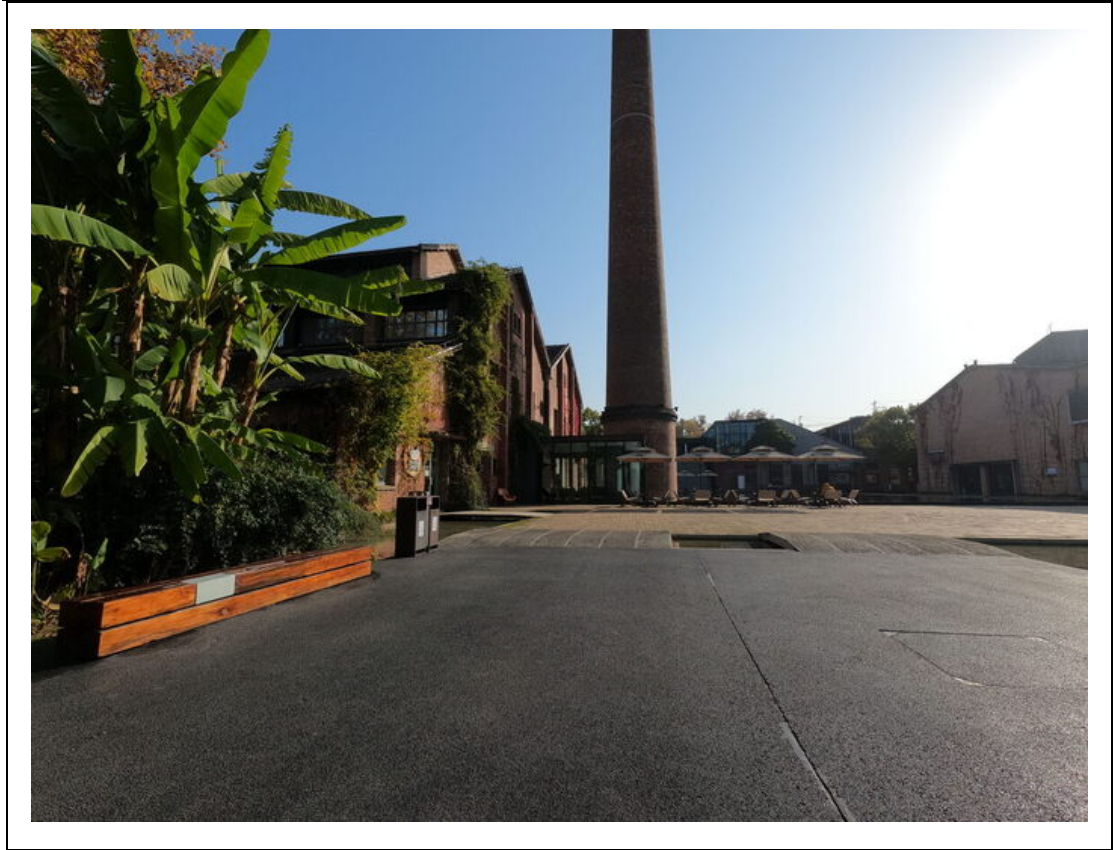
Tao Apartment is based in Taoxichuan Ceramic Art Avenue