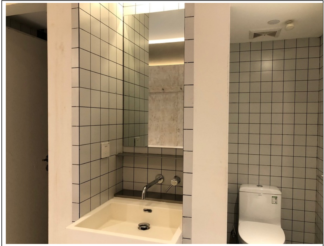
Bathroom for bunk bedroom