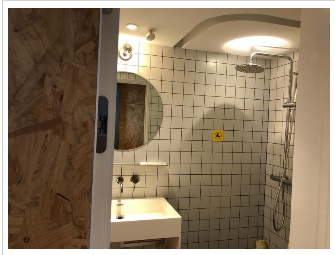
Loft bedroom bathroom