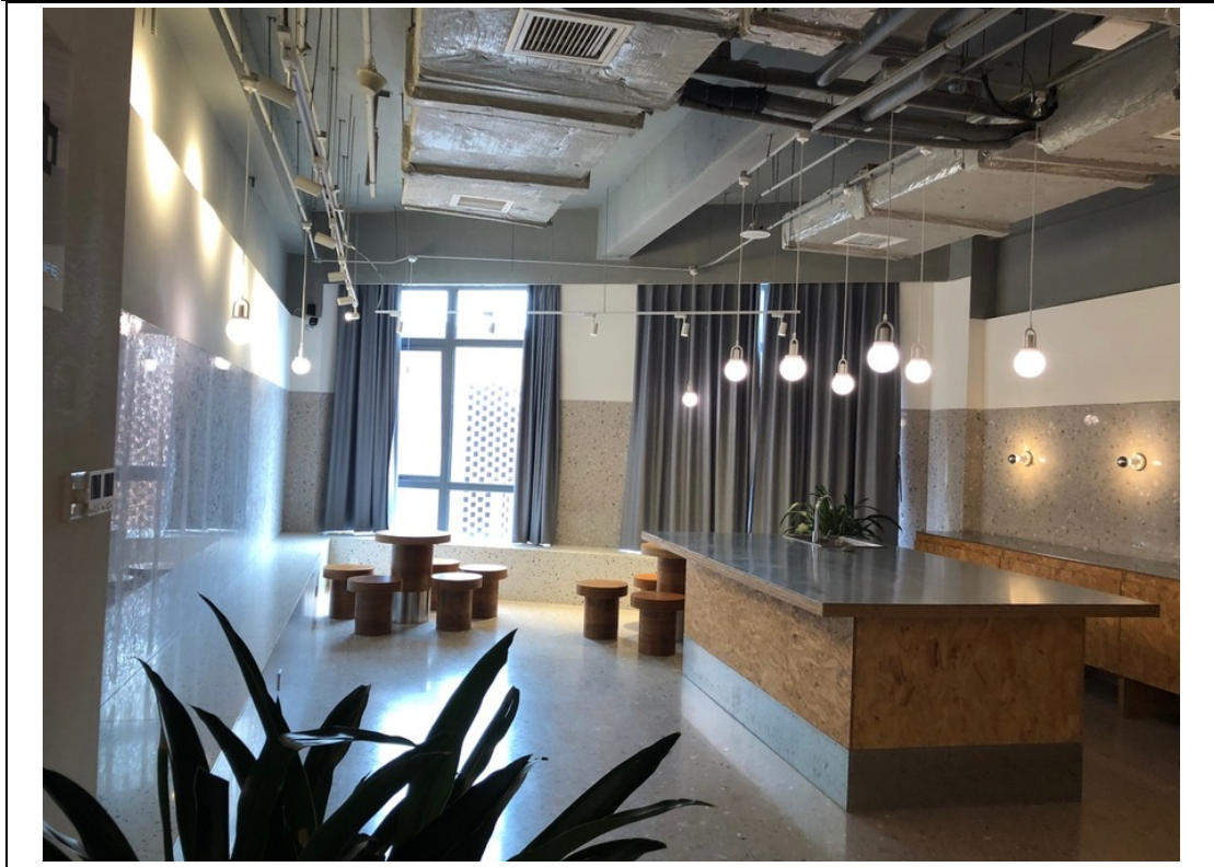
Visiting area of Tao Apartment