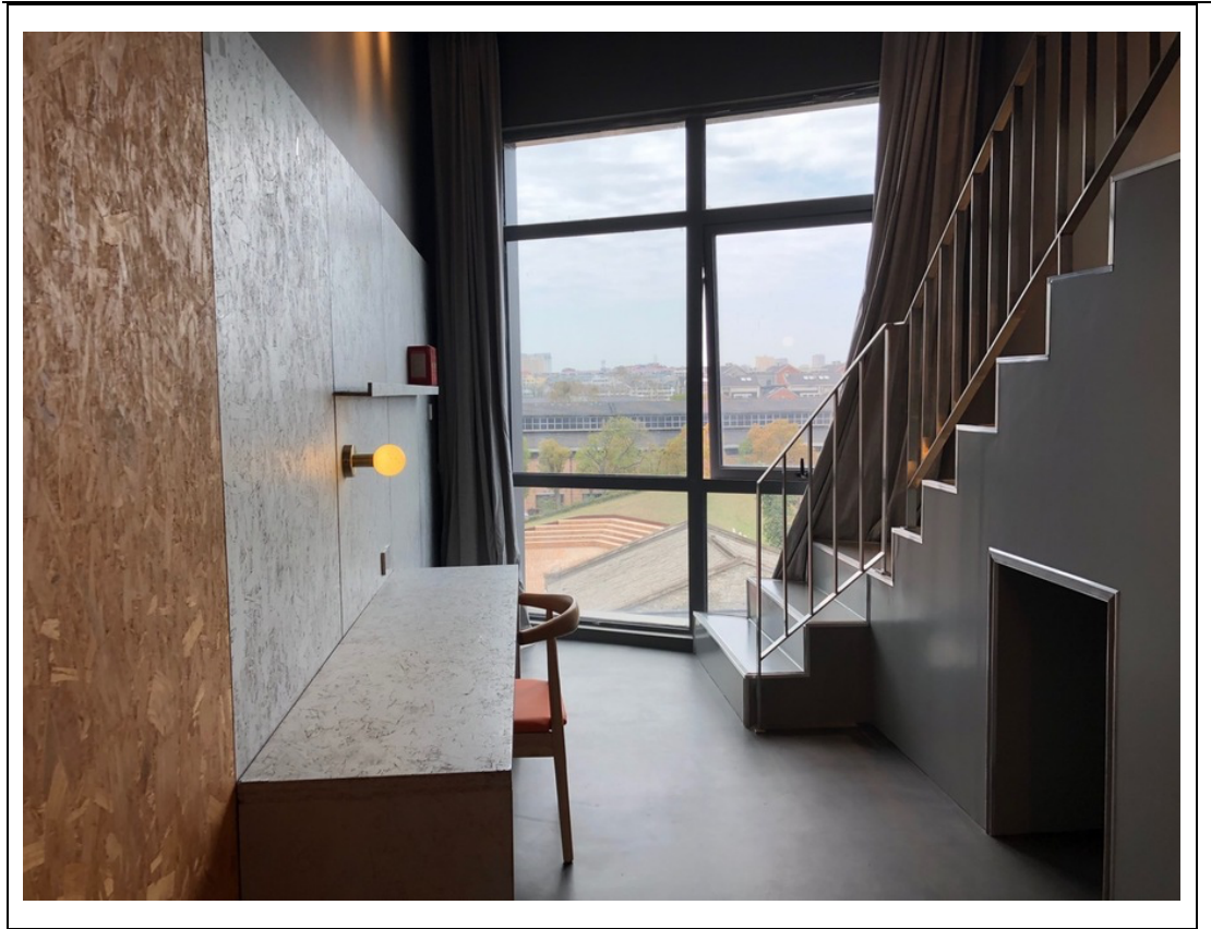
Loft bedroom desk