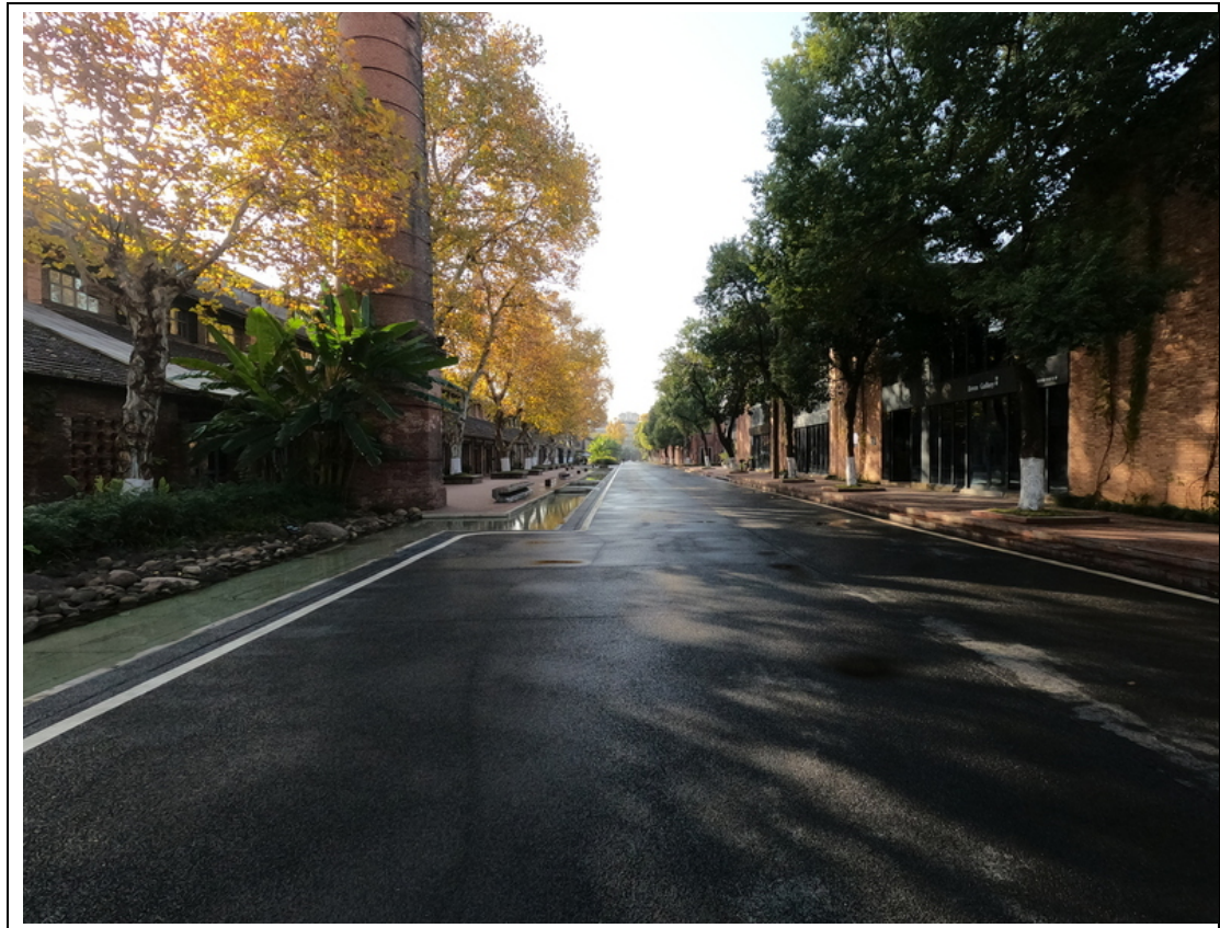
Tao Apartment is based in Taoxichuan Ceramic Art Avenue