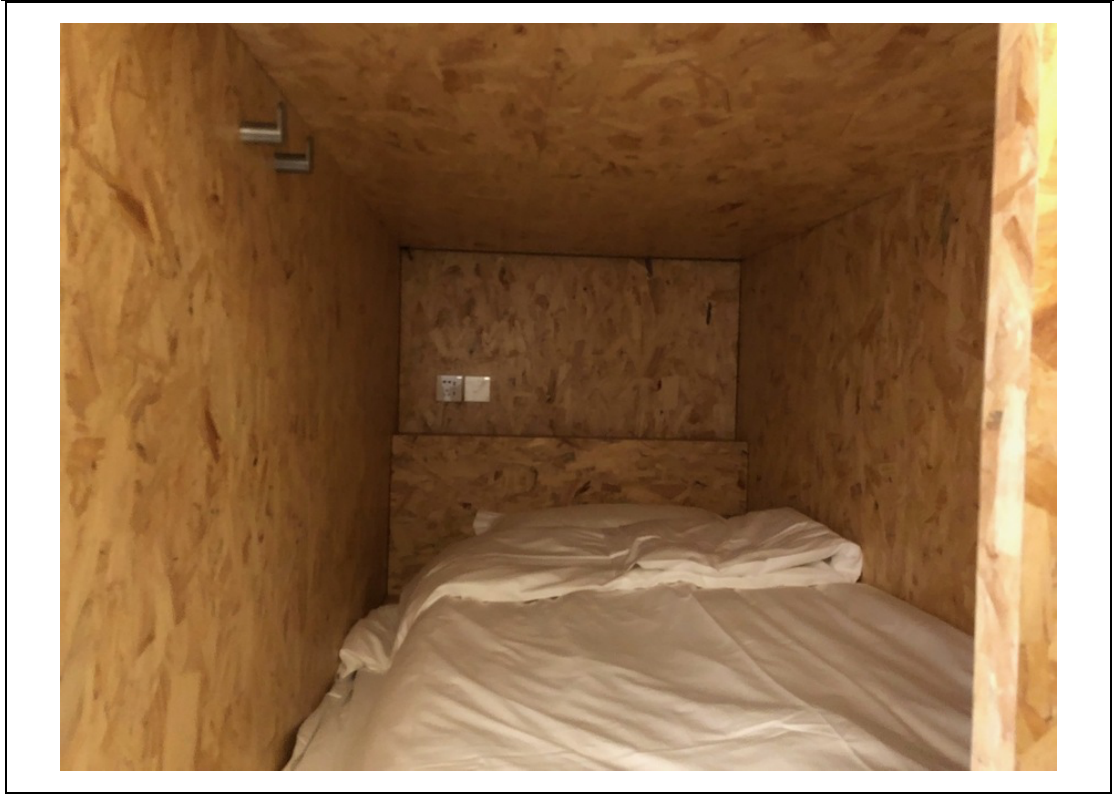
Each bunk bed looking like this