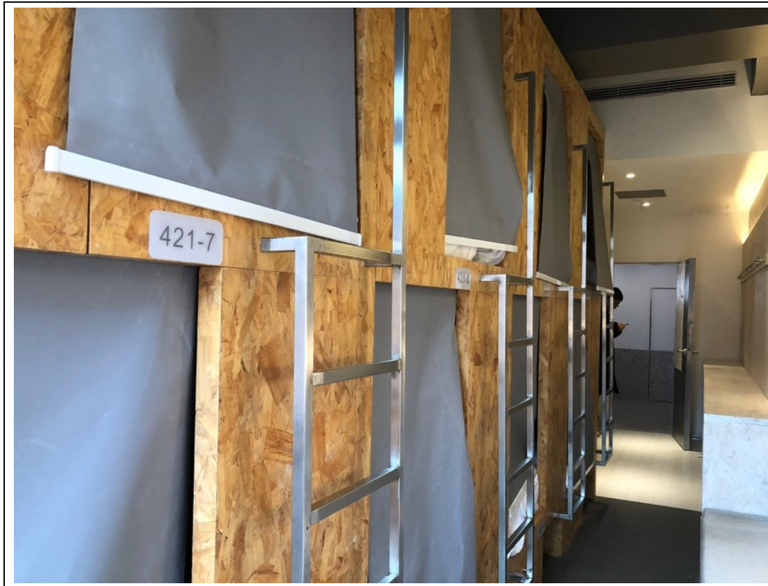
Bunk bedroom 8 people