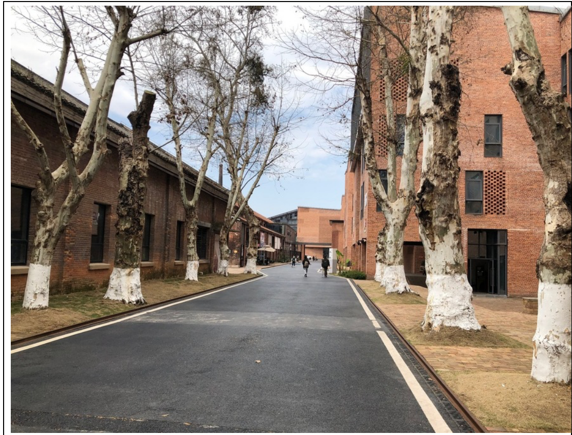
Tao Apartment Building outside view