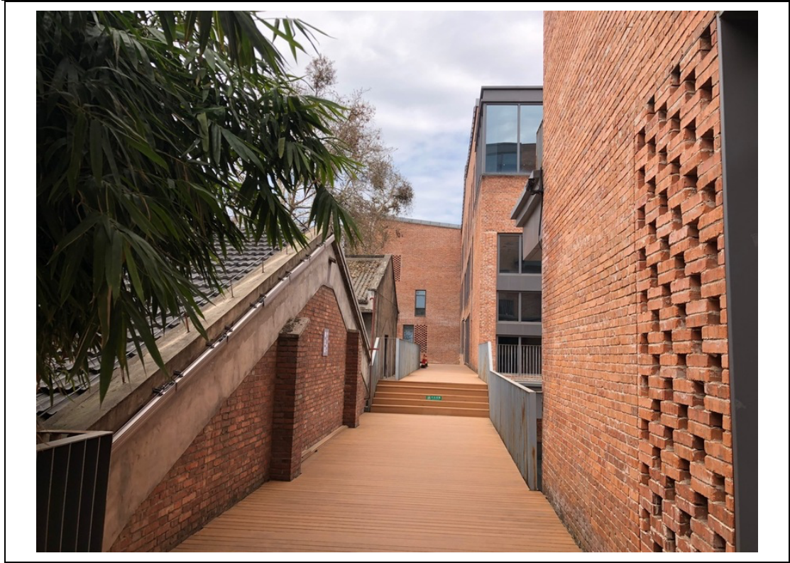
Tao Apartment Building outside view