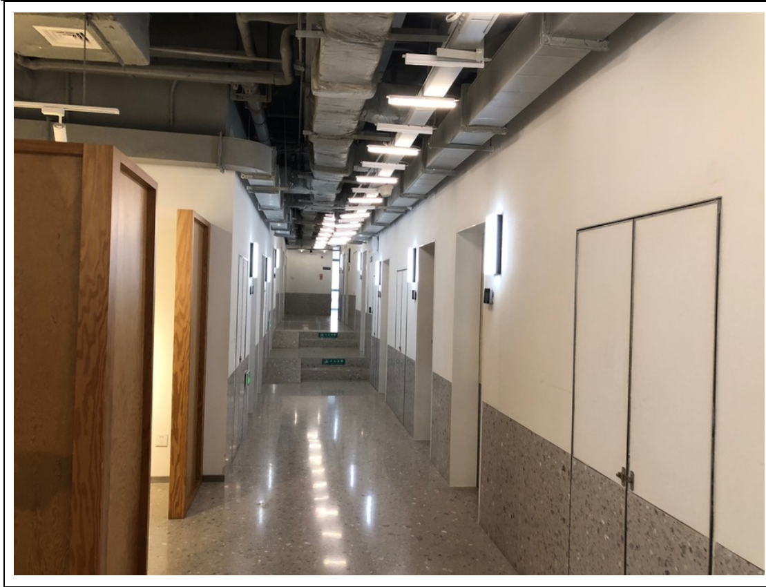
Corridor and rooms on two sides