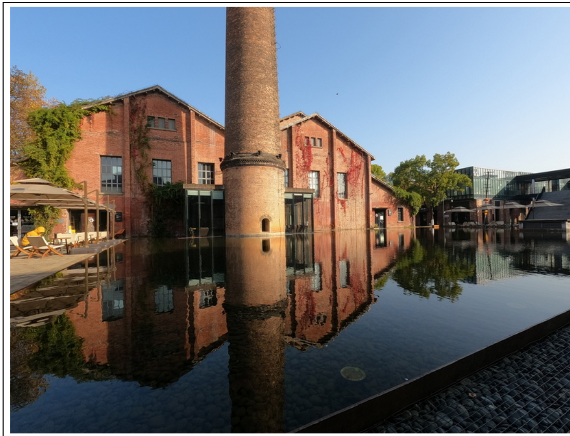
Tao Apartment is based in Taoxichuan Ceramic Art Avenue