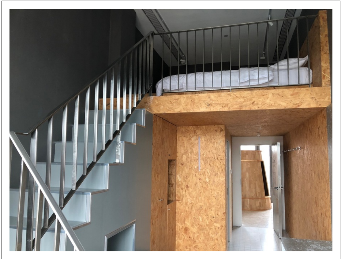
Loft bedroom layout